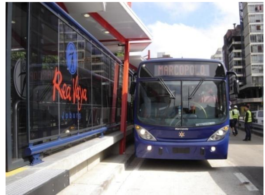
One of the buses

used to provide the City with confident estimates of what BRT operating costs can be covered by fare revenue, and what BRT costs need to be covered by government. Documentation to support the raising of funding for the buses from financial institutions has relied completely on the outputs from the model. The financial model has enabled the City also to determine what fares it must charge. The fare proposals, prepared by the GTZ team, are presently published for public comments by the residents of Johannesburg. The GTZ team has also advised the City as to what fee per kilometre it should pay to the bus operating company that will be contracted for 12 years to provide the first services. It has prepared the “escalation” formula for adjusting the fee as costs rise over time. These elements of constructing the “business model” for the BRT have been supported by the work of local GTZ contractors who prepared the concepts, contract packages and ground rules for the participation of the existing bus and minibus-taxi operators in the BRT system as its future operators. They also carried out detailed planning of which existing routes need to be subsumed by BRT and estimated the impact on various taxi associations and bus operators of each phase. They have also prepared documents outlining the City’s first “offer” to the first bus operating company. (This will be presented when this company is formed.)