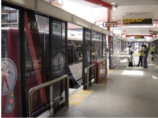
A typical BRT station

Fifthly, the GTZ team has provided advice on measuring and maximising the environmental benefits of the BRT. It has guided the work being done presently to prepare an environmental baseline for the BRT routes, after which GTZ will contract a CDM specialist, to assist the project to become registered for Clean Development Mechanism (CDM) credits.