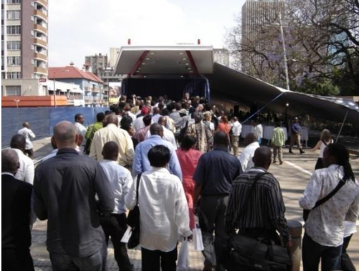
People using BRT

The position, size and layout of the City-owned BRT bus depots – temporary and permanent - has also resulted from the GTZ team work in scoping and sizing the depot facilities required in each phase. Bus staging areas and termini have likewise been scoped and sized for the engineers designing and building them.